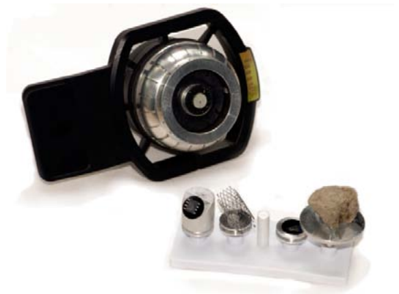
Phenom Sample cup and holders

The Phenom helps balance the workload on existing SEMs while increasing schedule efficiency. It increases a lab's overall magnification capacity by offloading routine work from the SEM at a cost level traditionally associated with an optical microscope.